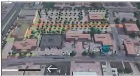
A basic master plan has been developed for a new community center complex. Stop by City Hall to see the plans on a larger scale.