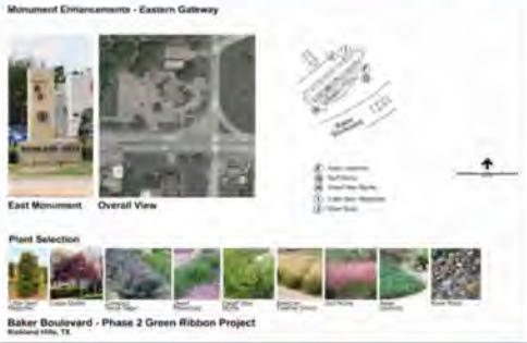
Baker Boulevard Improvements. Drought tolerant trees and perennials with a drip irrigation system for efficient watering.