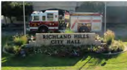
In late October the Fire Dept. placed into service the City's new fire engine, Engine 291. This is the Fire Department's primary response apparatus.